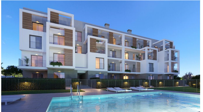
Ático con terraza privatizada